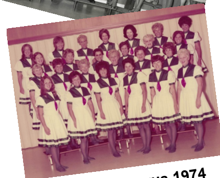
Friendly City Chorus 1974

As everyone also knows, wearing costumes is a normal part of being a Sweet Adeline. The costumes worn by the Bradenton Chapter were described as “flowing yellow gowns with wide motoring hats delicately tied with chiffon.” The costumes worn by the Friendly City Chapter, on the other hand, sounded a bit more unusual in that they were described as “blue and white bathing suits from the 1800s.” The competition photo shows members wearing dark stockings with the costume, but NO shoes!