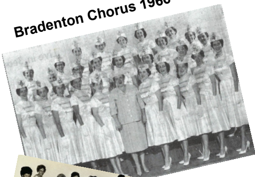
Bradenton Chorus 1966