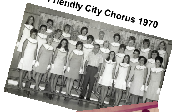
Friendly City Chorus 1970